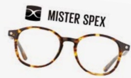
Glasses by Mister Spex

For example: Mr. Spex. We believed in the company from an early stage and are its first investor.